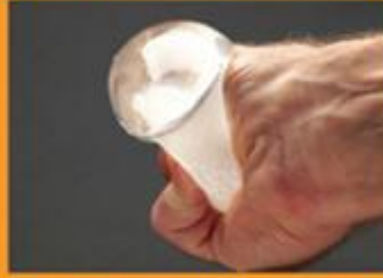
Pressure induced gel displacement